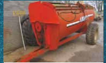
Abbey 2070 Barrel Spreader Refurbished, Good hammers £1,575