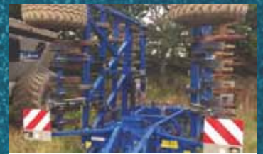
Kockerling all-rounder Profiline £18,599