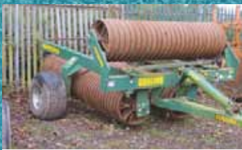
Cousins 8.2m Hydraulic Folding Rollers Cambridge Rings £4,950