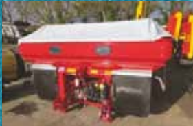
Teagle Centreliner Fertiliser Spreader IN STOCK