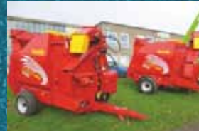
Teagle Strawshredders In stock 0% Finance Available