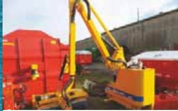
Shelbourne 457 Hedgetrimmer Slew Electric Controls Hammer Flails, 3 Point Linkage £12,950