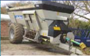
Shelbourne Reynolds 3200 Sidespreader, In Excellent Condition, Little Used £18,450