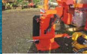
Browns Hydraulic 3 Point Linkage Log Splitter £895