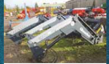
Quicke Loaders New & Used Buckets, Sheargrabs Dunggrabs ALWAYS IN STOCK