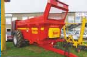
Teagle Titan 9 ton Rear Discharge Manure Spreader IN STOCK