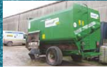
Keenan K 160 Diet Feeder Average Condition £3,450