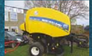
New Holland RB 150 Variable Chamber Round Baler, 0% Finance IN STOCK