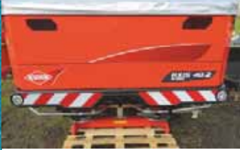
Kuhn Fertiliser New Model EMC, In stock POA