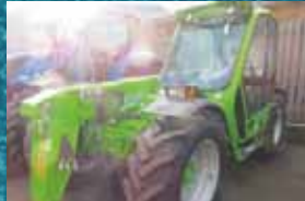
Merlo Handlers New & Used in stock Demos available 0% Finance