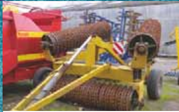
Twose 6.3m Hydraulic Folding Rollers Cambridge Breaker Rings £5,650