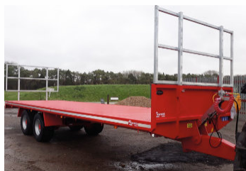
WARWICK BALE TRAILER AIR/HYD BRAKES, LOAD SENSING - £12,250