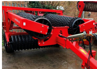
HE-VA CAMBRIDGE BREAKER VIP ROLLERS 6.3M 22" (9 SPOKE) - £8,975