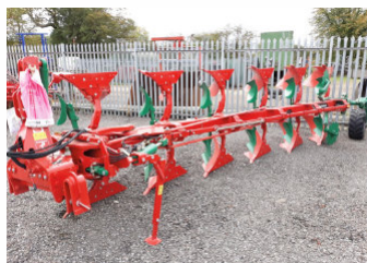
KVERNELAND - NEW & DEMO - GRASSLAND & CULTIVATION