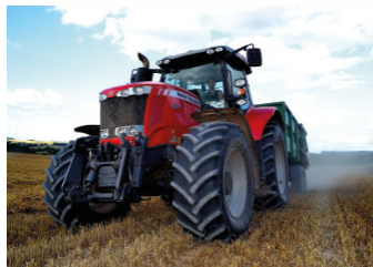
MF 7720 - 2017, FRONT LINKAGE, DATA 4, NEW TYRES - £53,500