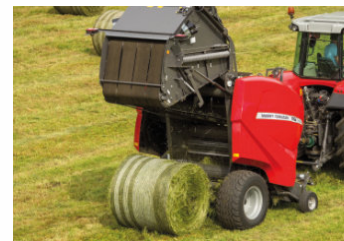
MASSEY FERGUSON 4160V - NEW STOCK & DEMO MODELS AVAILABLE