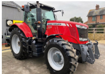
MF 7620 DYNA VT, GUIDANCE READY, 2012, IOW - £31,795