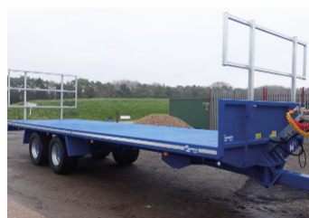
WARWICK BALE TRAILER AIR/HYD BRAKES, LOAD SENSING - £10,800