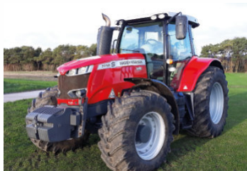
MF 7718 S EX-HIRE, DYNA 6, CAB SUSP. 50KPH, 3,000 HR, POWER SHUTTLE - £59,000