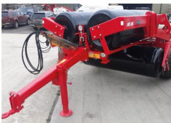
HE-VA FLAT GRASS ROLLER 6.3M £11,850