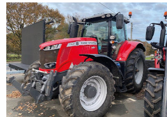
MF 7722 S DVT LOW HOURS, 2.5 YR WARRANTY - £85,500