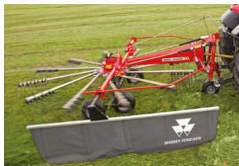
MASSEY FERGUSON RAKES, MOWERS & TEDDERS NEW STOCK IN SOON