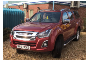
ISUZU D-MAX UTAH MANUAL, 2017, 45,500M - £18,000